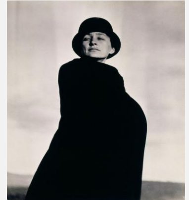
Alfred Stieglitz (American, 1864-1946), Georgia O'Keeffe, circa 1920-22. Gelatin Silver print, Georgia O'Keeffe Museum, Santa Fe, NM

In addition to the museum's extraordinary collections of American, European and Egyptian art (and so much more!) we will have an opportunity view GEORGIA O'KEEFFE: LIVING MODERN , a major exhibit about the artist's life and work including articles of her clothing and photographs of her and her homes by Alfred Stieglitz, Ansel Adams, Yousuf Karsh, Andy Warhol and others. Join us for a visit to the one of the world's great museums and the adjacent BROOKLYN BOTANIC GARDEN where the lilacs should still be bloom. COST: $75. Lunch is available in the museum's cafe. Museum and garden entrance fees are on your ow